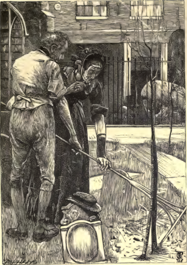
Time and his Wife.